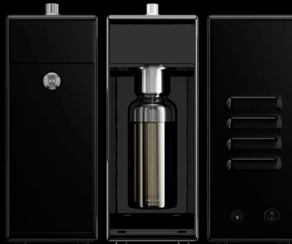
200ml Oil Reservoir